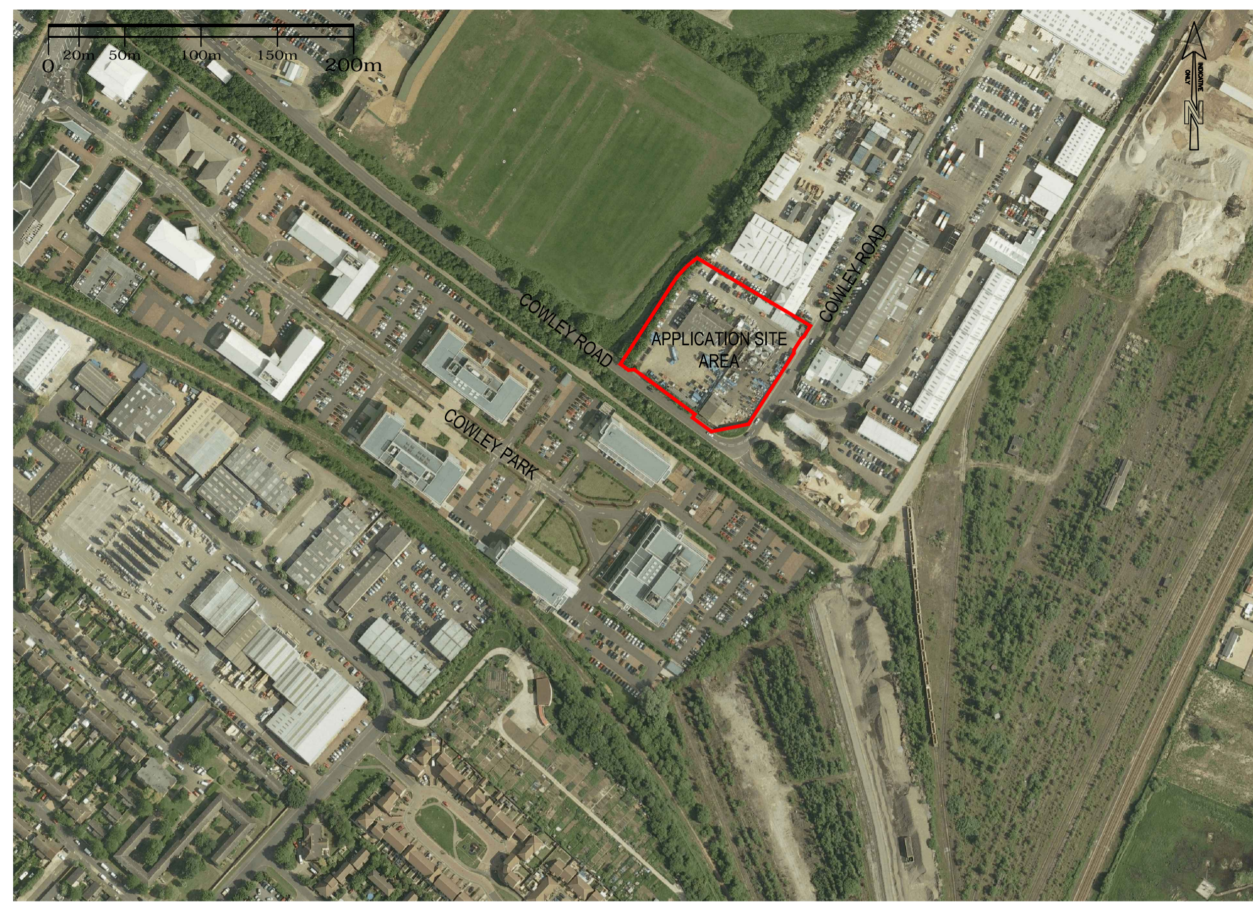
SITE LOCATION PLAN SCALE 1:2500 @ A1, 1:5000 @ A3